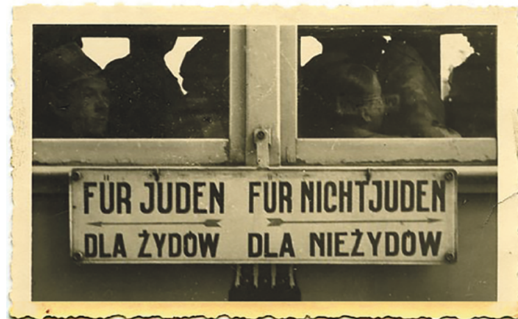
For Jews (left), For non-Jews (right)

From the autumn, anyone working in a Care Quality Commission-registered care home in England must have a minimum of two doses of a covid-19 vaccine unless they