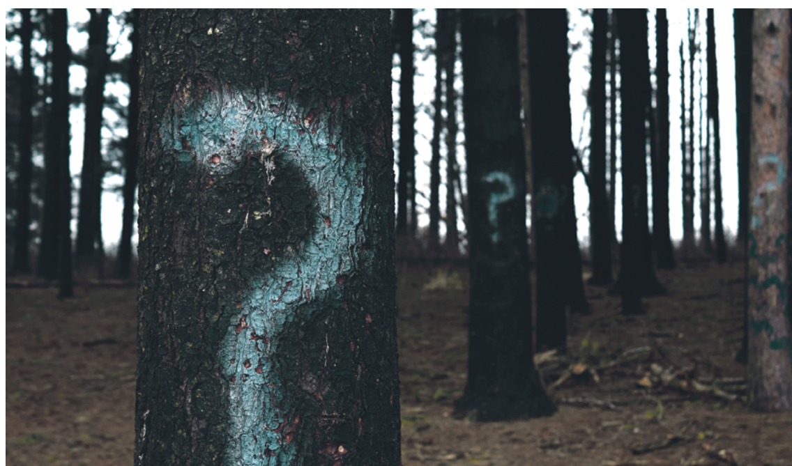
SEEING THE WOOD FOR THE TREES; many collateral harms have come from covid measures

Virus particles are about the same size as smoke particles and