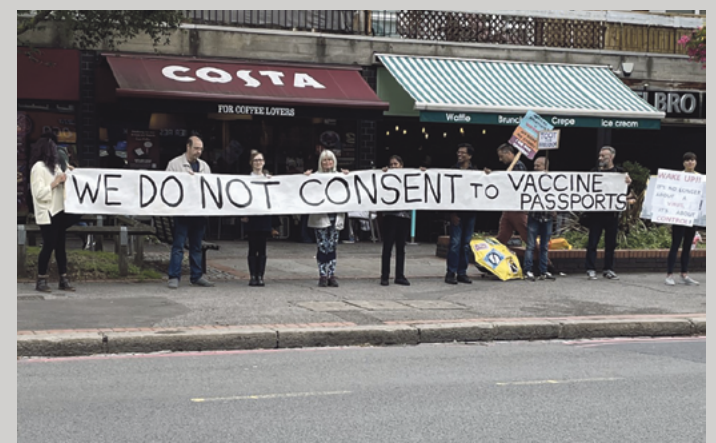
Making a stand on Carshalton High St, London

We have had some abuse too. On one occasion a woman came up to me and asked if we're 'anti-vaxxers'. I politely explained that we were protesting against